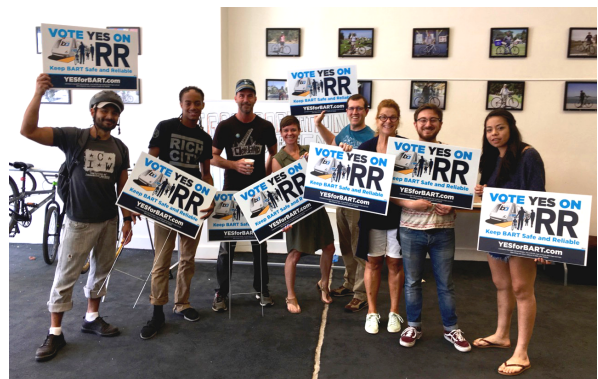
YES on RR campaign volunteers were in the community six days a week, talking to thousands of voters on the phone and door-to-door.

A strong field program staffed four offices around the Bay Area for nightly phone banks and weekly walks, including one office focused on Chinese-language calls. In addition, the YES on RR campaign partnered with local measures and candidates to incorporate their volunteers into the RR campaign for a combined effort.