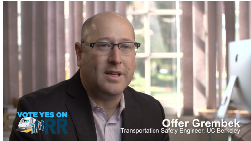
Television and online ads for Measure RR included a transportation safety engineer to stress the importance of keeping BART safe and reliable.

Adding to the complexity of the election environment was a fierce opposition campaign spearheaded by one of the region’s state senators and the editorial board of one of the major local newspapers. It was vital that the YES on RR message rise above the noise of the opposition. Whether voters were reached by direct mail; a phone call or text message; a door-to-door volunteer; a TV, radio or newspaper ad; a yard sign or in-station BART ad; or an online banner or video ad, every message targeted to voters included the same disciplined refrain: Keep BART safe and reliable.